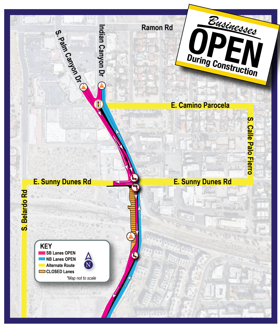
This schedule may change due to weather or field conditions.

Once traffic control is set, it will remain in place for approximately 8 to 10 months until the new western bridge span is constructed. Once completed, lane closures and traffic control will shift to the new western bridge span and construction will continue on the eastern bridge span for approximately 8 to 10 months.